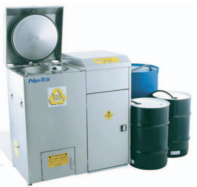
SolvKlene II DB100G shown with standard drums for collection of solvent and waste water

emissions and improving profits. With SolvKlene II , the solvent waste that must be transported from the plant is drastically cut. This may mean an improvement in the Hazardous Waste Generation classification of the plant and