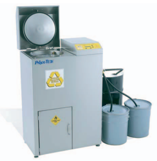
SolvKlene II BB30G shown with standard drums for collection of solvent and waste water