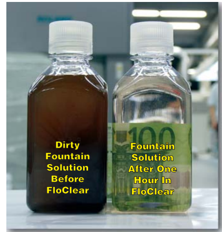
Used fountain solution before and after treatment by FloClear

With the FloClear System, printers can easily and reliably reduce their costs and improve productivity in an area that has been traditionally neglected. Simply eliminating dampening system maintenance and trouble-shooting will typically add 1-2 hours of productivity per week. Additionally, by extending the life of the fountain solution, waste hauling costs will be dramatically reduced. If you are not hauling, the FloClear will greatly reduce the copper, zinc, ink, glycols, phosphates and suspended solids going into the drain, reducing your environmental liabilities.